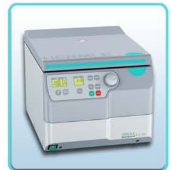
Z306 Universal Centrifuge